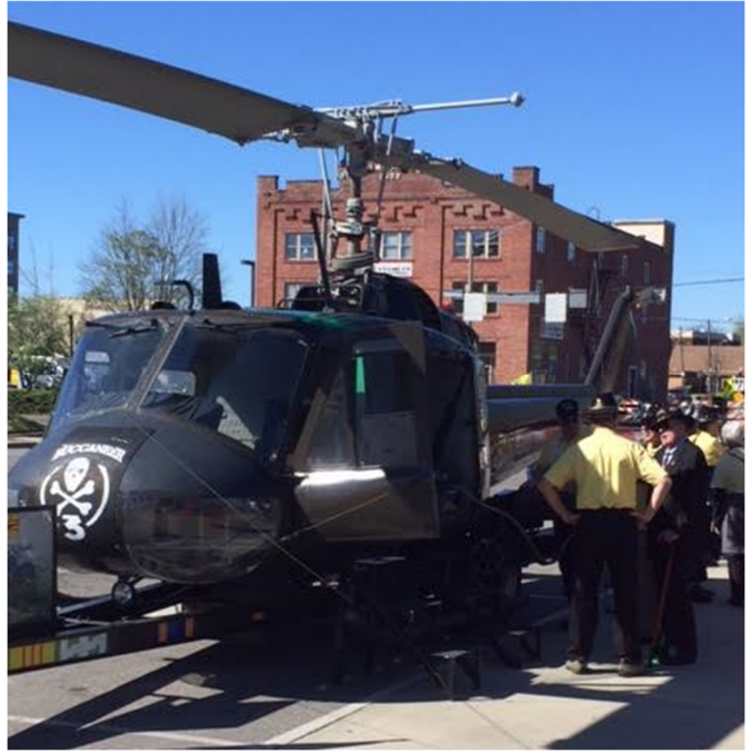
BUC 3 on display in Huntsville.

The Vietnam Veterans of America, Huntsville Chapter 1067 has close to 470 active members. The North Alabama Chapter of the Vietnam Helicopter Pilots Association has approximately 70 members.