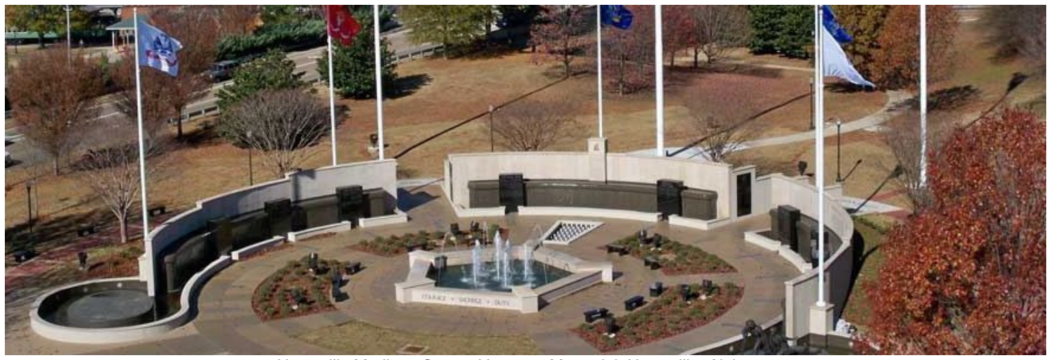
Huntsville Madison County Veterans Memorial, Huntsville, Alabama